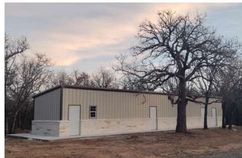
Prayer and Mission Center CDF@Solid Rock

Thank you for joining us in prayer, for standing with us!