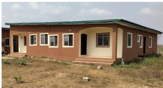
Additional Imala Housing (Missionary, Student)